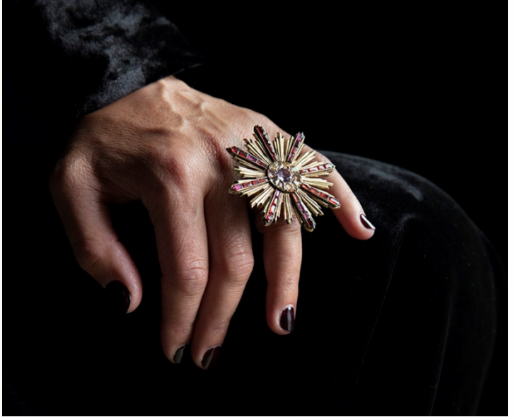
Jill Newhouse LLC 4 East 81st Street New York, NY 10028

A mid-17<sup>th</sup> century Baroque embossed silver plaque becomes a large dazzling necklace. An 18<sup>th</sup> century button from a Georgian court costume becomes a unique ring. A 15<sup>th</sup> century Venetian ivory relief is turned into a unique pendant and pieces of a Renaissance belt in silver with vermeil rosettes, studded with silver pearls are transformed into a chic and wearable bracelet.