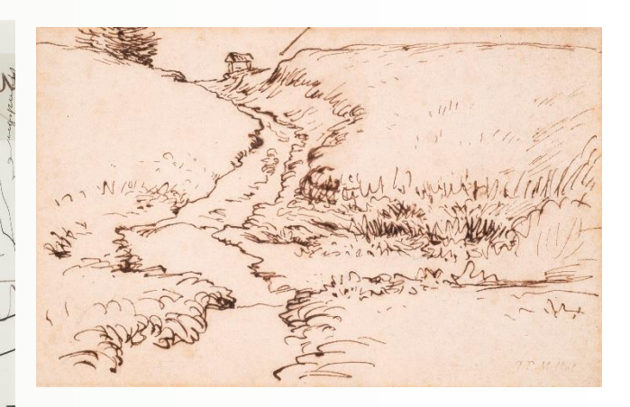
Left : Albert Oehlen, Untitled , 2010, Pencil, ink, and paper collage on paper, 11 3/4 x 8 1/4 inches © Albert Oehlen, Courtesy David Nolan Gallery

Albert Oehlen's mature 'post-no painting. The rigorous gestures r