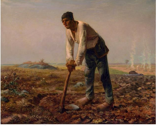
Left: Jean-François Millet, The Gleaners, © Musée d'Orsay Right: Man with Hoe, Getty Center, Los Angeles

This exhibition's dual focus on Figure and Landscape offers a possibility to look at how these themes were reconfigured in the mid 19th century, and to examine the effects today. Millet's compassionate, yet sober approach to the depiction of the human figure echoes in contemporary artists' approach to figuration. At the same time, the radical concept of a newly liberated depiction of nature as practiced by the Barbizon School of artists, has clearly set the tone for the ecological vision of 21st century artists. The implicit social narrative of these landscapes radicalized an anti-academic approach to this genre and relinquished it from any classical or romantic traditions. Furthermore, thus reconfigured representations of nature constituted a proto-ecological world-view. This intentional depiction of Nature devoid of human control has a strong reverberation in contemporary approaches to landscape. The newly constructed Realist immediacy of the Barbizon school propelled the depiction