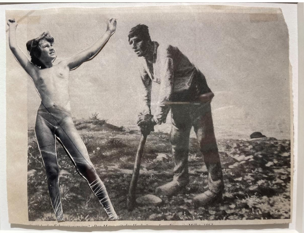
Albert Oehlen, Untitled, 2004, Cut-and-pasted printed paper on printed paper, 6 x 7 3/4 inches, © Albert Oehlen, Courtesy David Nolan Gallery

Contemporary figurative drawing has reached beyond the historical practice of drawing from life to capture the drama of representation. Many artists are incorporating drawings in larger expanded media works, such as video and installation. Since the advent of the modernist period, contemporary drawing has remained a powerful medium that is not only limited to pencil or ink on paper, but includes collage techniques as well. This selection of contemporary drawings shares the spare means to reach for the directness achieved in Realism. The 19th century artists present here use an objective, yet compassionate observation of life that has little to do with superficial verisimilitude. Rather than seeking to represent the drama of life, realism is focused on the drama of representation itself.