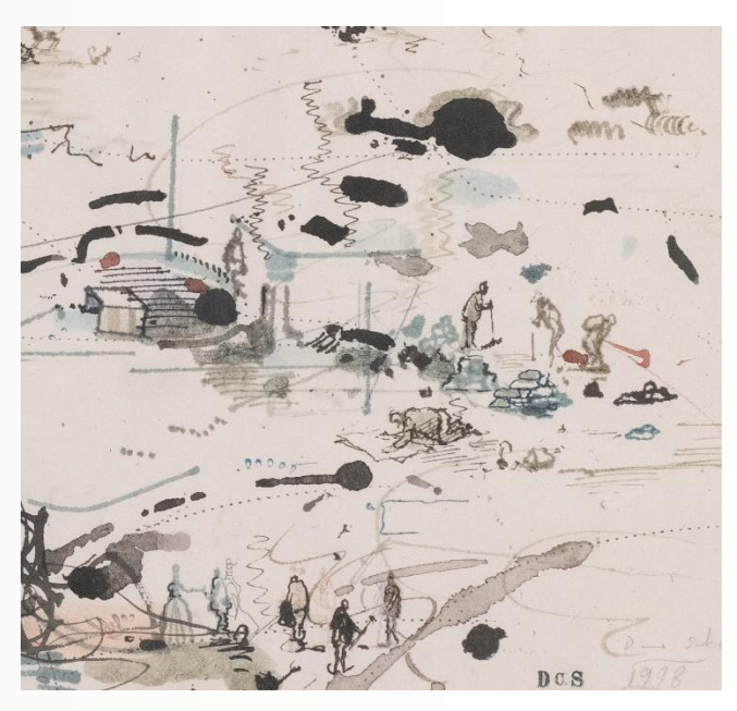
Left: Jean-Francois Millet, A Miller Loading a Sack of Flour on to his Horse, Black conte crayon and black chalk on paper, 8 7/8 x 6 1/2 inches Right: David Scher, My Country is Where I Stand It Up (detail), 1998, Ink and watercolor on handmade linen paper, 23.5 x 17.75 inches, courtesy of the artist and Pierogi Gallery

David Scher's drawings of laborers are closely related to the immediacy of 19th century realism. Scher's figures are often isolated within their environment where their actions become the focus—whether climbing a ladder, hammering a nail, drilling a hole, or simply sitting at rest. The artist elevates those who work with their hands, drawing parallels between the artist and blue-collar worker; he suggests that the skill of a manual laborer is no less worth celebrating than that of an artist. According to the artist, M My Country is Where I Stand It Up (1998), ink and watercolor on handmade linen paper, depicts workers, citizens who are seen erecting structures, moving materials, organizing nature. Scher's Boat with Parasol, pencil and watercolor, 2021 speaks a visual language of the 19th century, but the theme is ambiguous. The artist poses a set of questions: "Why a boat? because one can paint water and skies and a thing with people in it. Is this a real scene? Is it a stage set? Are they on their way to our present from our (art historical) past? How does this drawing succeed and how does it disappoint? Who are they? Why do they not have oars, a sail, a motor? Is the boat riding too high in the water? Are they on holiday? Is this a disappointing romance of migrants at sea? Is one of them a migrant? Are none of them? Are they just drawings?