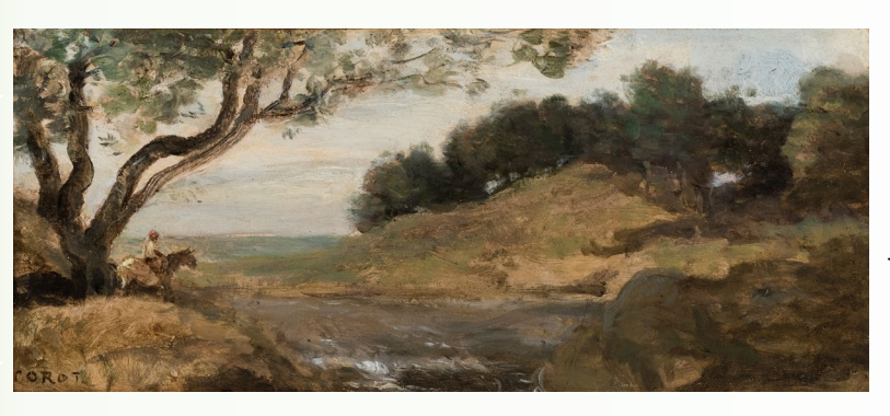
Jean-Baptiste-Camille Corot, Rider Under a Tree (Cavalier sons un arbre) , c. 1870-72 Oil on paper mounted to canvas 4 7/8 x 11 1/8 inches

Contemporary artists' landscapes in this exhibition create a multivocal dialogue with the 19<sup>th</sup> century works of the masters of the genre from Eugène Delacroix, Théodore Rousseau, Jean-Baptiste-Camille Corot, Victor Hugo, and Paul Cèzanne. For these earlier artists, the landscape outside Paris was the center of the world and Nature's unmediated presence was the main protagonist of their art. It is these artists' pursuit of immediacy in representing their surroundings that is one of the key impetuses for the modern transformation of the visible. By exhibiting these works alongside that of contemporary artists, we can see how the traditional is transformed into the modern and the contemporary.